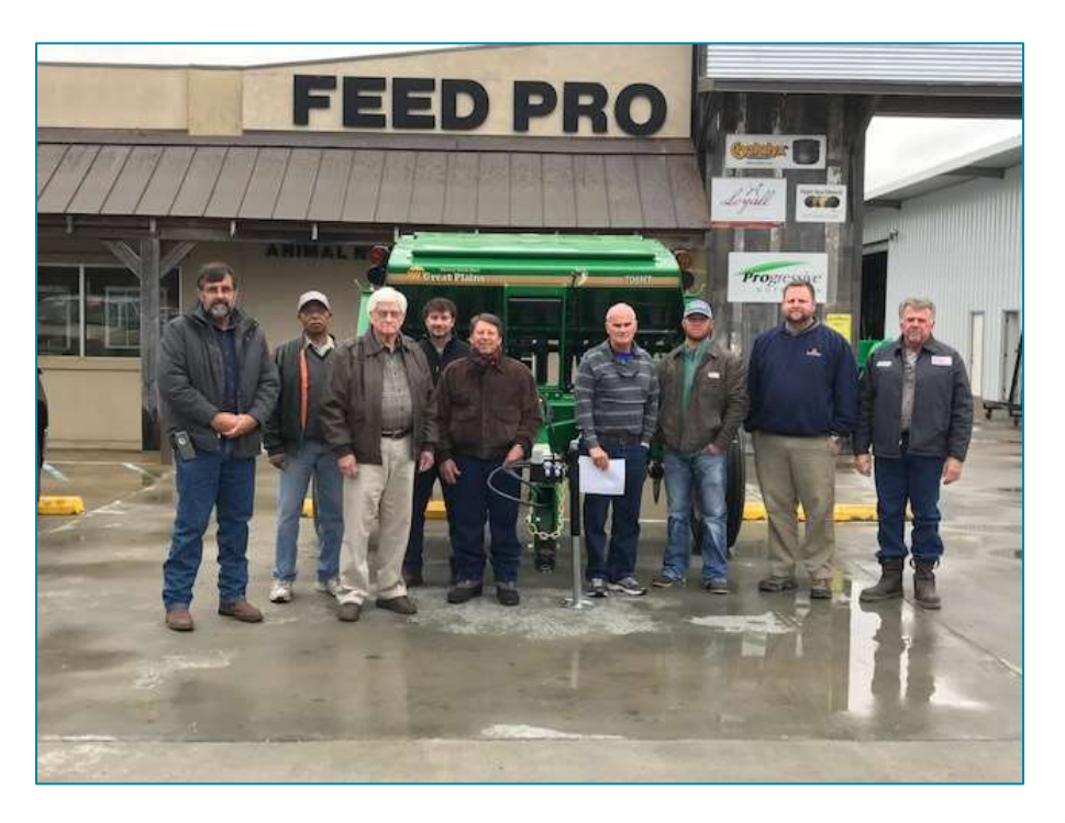
Figure 4 No-till grain drill opening ceremony, January 6, 2017 at Feed Pro in Sunset, LA.