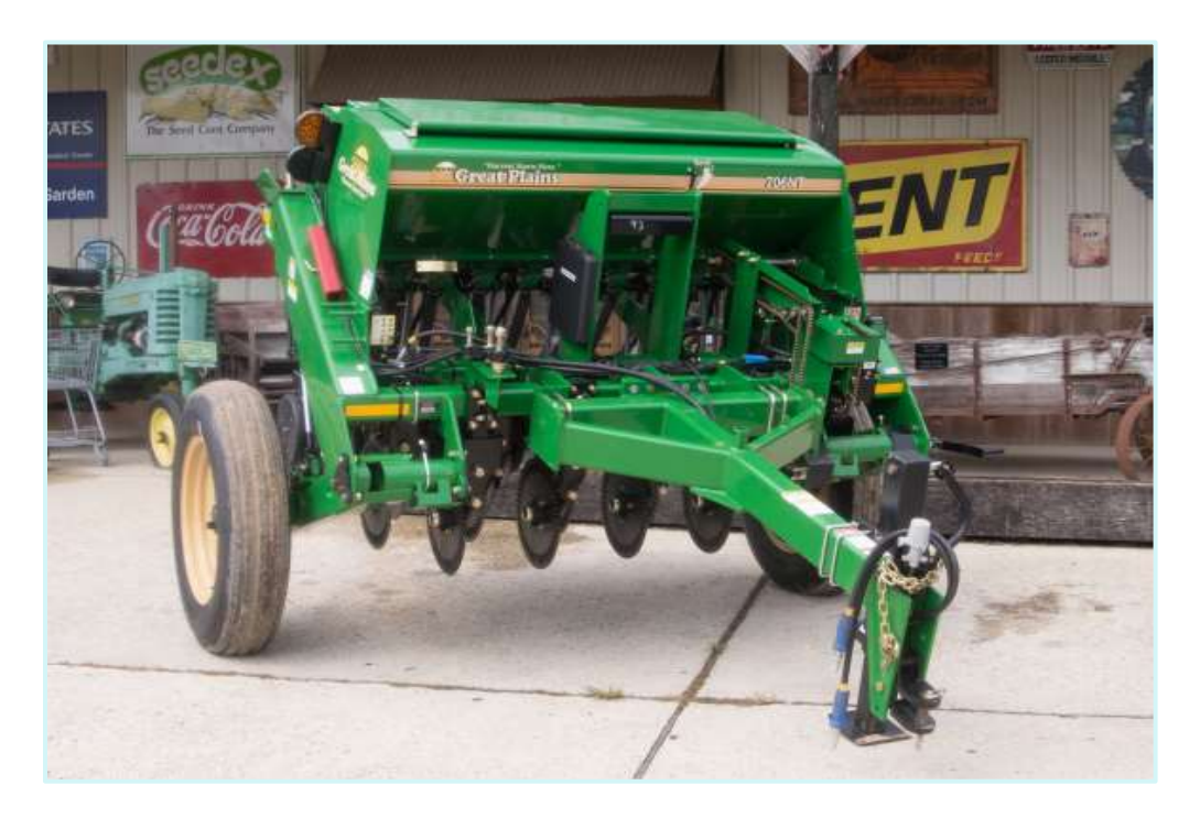
Figure 3 Seven-foot no-till grain drill located at Feed Pro in Sunset, LA

On January 06, 2017, a press release (Appendix A) was issued explaining the opportunity for local producers to reduce the amount of runoff of pesticides, fertilizer, and sediment, through the use of no-till grain drill equipment (Figure 3). The RC&D also conducted an opening ceremony on that day, to introduce the program. The opening ceremony was held at the Feed Pro in Sunset, LA. Those who attended were members of Capital RC&D, Feed Pro, R.S. Coop, St. Landry Soil and Water Conservation District, Natural Resource Conservation Service (NRCS) and Great Plains Ag (Figure 4). Potential users were educated on the many benefits of using the no-till grain drill equipment as a conservation measure, such as reducing the runoff of sediment. Once the grain drills were purchased and placed at Feed Pro/R.S. Coop, a rental program was put in place to cover the maintenance and storage of the equipment and also to ensure their availability to the producers. Capital RC&D was the principal lead for the project. Together, with the St. Landry Soil and Water Conservation District, the progress of the rental program was monitored. In-kind match was provided by the producers as a result of the costs associated with project demonstration (Table 3).