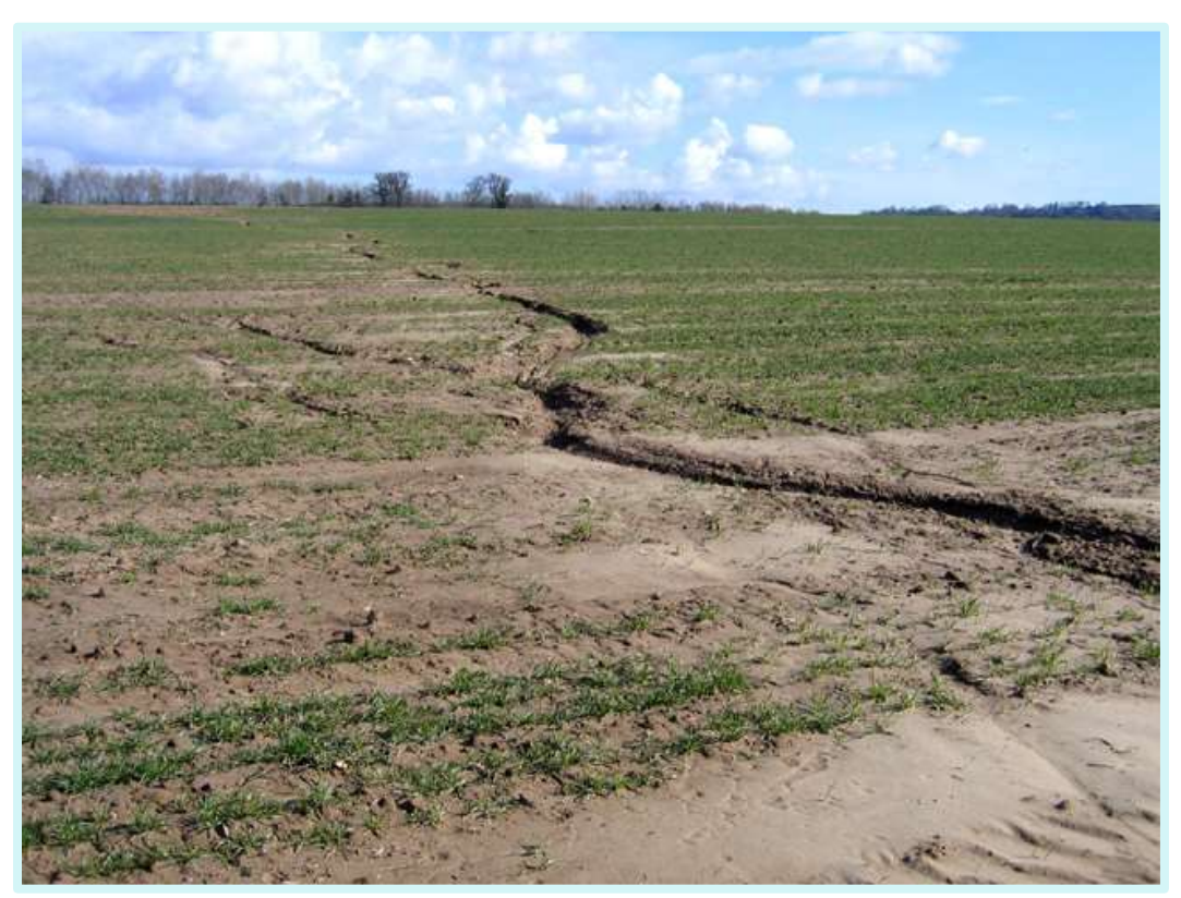
Figure 2 Tract of land before the use of no-till grain drills

The goal of this project was to use Clean Water Act (CWA) Section 319 federal funds to purchase and utilize two no-till grain drills. Figure 2 illustrates a tract of land before the use of no-till grain drills. The equipment was placed at R.S. Co-operative and Feed Pro, both located in St. Landry Parish. By applying no-till grain drill demonstrations throughout the parish, the objective was to reduce soil erosion; the amounts of fertilizer applied/run off; and improve water quality in areas that are affected by the livestock industry. The use of these drills allowed for direct seeding into permanent pastures, thus resulting in a reduction of sediment, pesticides and nutrients from reaching nearby streams; therefore, improving water quality in those areas.