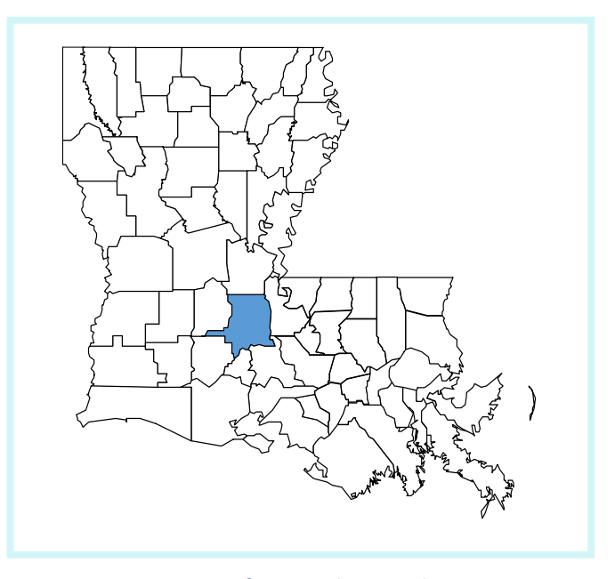
Figure 1 Location of St. Landry Parish in Louisiana