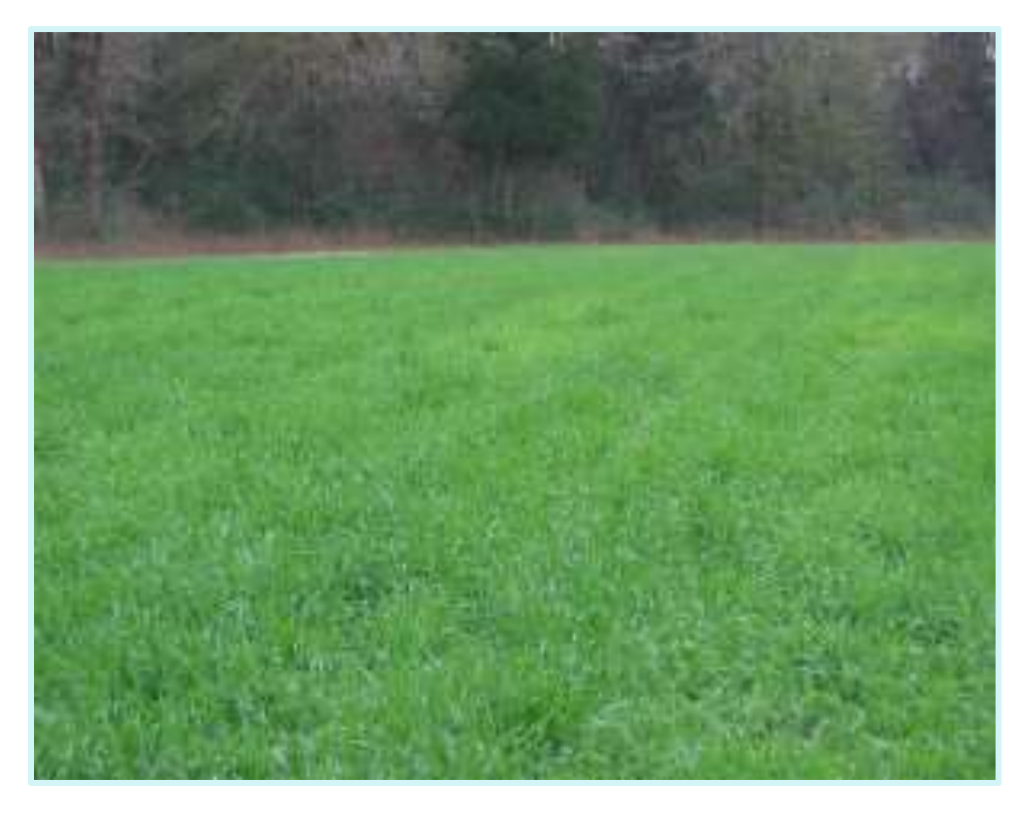
Figure 7 Tract of land after the use of no-till grain drill

The environmental benefits of the no-till grain drills project are plentiful. In an effort to illustrate how the reductions were obtained, Natural Resource Conservation Service (NRCS) used RUSLE2 in the soil erosion calculations. For nutrient reduction, NRCS assumed 6.9 tons of soil loss per acre/per year difference, and assuming about 50 parts per million (ppm) of potassium (P) and phosphorus (K) in a soil test, that is equivalent to a loss of approximately 2 pounds per acre/per year of phosphorus and potassium. Nitrogen is at a direct loss of about two pounds/acre. In a clean tilled situation, there may be a loss of infiltration capacity on plowed ground, as well as soil health and function. The transport of nutrients, is often ten times the amount of what is calculated above, to nearby water bodies. Figure 7 illustrates a tract of land after the use of a no-till grain drill.