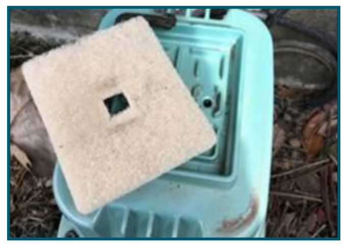
Figure 6. Cleaning/replacing air filter on the aerator is part of the outreach education program