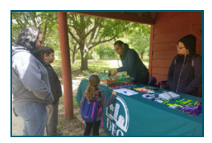
Figure 14. Bayou Vermilion District Earth Day