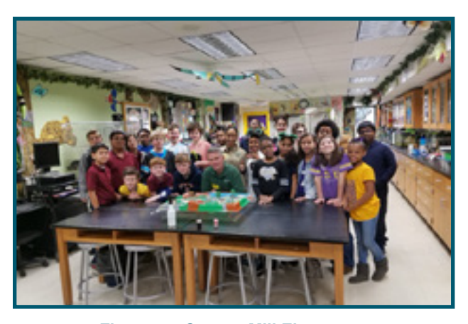
Figure 11. Copper Mill Elementary