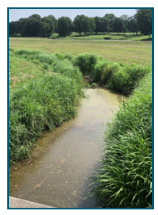
Figure 2 Vermilion River - Site 4882 (Bayou Bourbeaux at Jack Fox Road West-Northwest of Sunset, LA). One of the 13 new sampling sites [most northern site] located in Lafayette Parish.

In 2016, WS conducted a reconnaissance of the watershed, resulting in the selection of twenty-four water quality sampling sites. Baseline water quality sampling for FC began in June 2016, under an EPA-approved sampling plan. Long-term sampling began in July 2017 in correlation with Bayou Vermilion District's (BVD) OSDS inspection program. In October 2018, a sampling plan revision was necessary to add 13 new sampling sites and nutrient sampling parameters (Total Kjeldahl Nitrogen (TKN), Total Phosphorus (TP), and Nitrate Nitrite) to establish nutrient baseline before LDAF BMP implementation. The sites were strategically selected within three HUCS: Bayou Bourbeaux (080801030101), Bayou Carencro (080801030102), and Bayou Bourbeaux- Grand Couteau (080801030103). The new sites will target potential BMP implementation locations, to detect water quality changes in these areas.