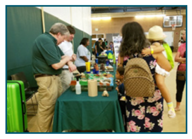
Figure 16. Southeastern Louisiana University Stem Festival