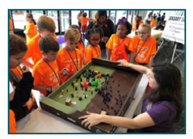
Figure 8. 22nd Annual Ocean Commotion