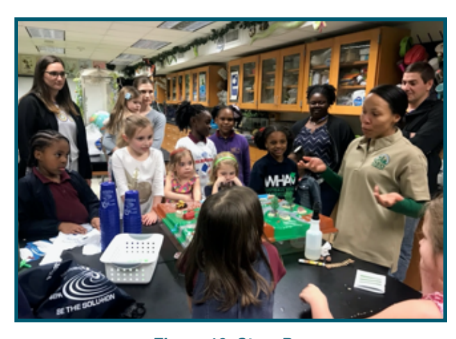
Figure 12. Stem Day

Louisiana Earth Day is an annual event held in Baton Rouge. LSU Parker Coliseum brought intercultural dancers, performances, and arts to the campus of LSU. Attendees experienced local honey farming, feeding horses, sharing native history of Louisiana culture and painting recycle flowers among many activities. LDEQ demonstrated NPS pollution model and provided information on water quality.