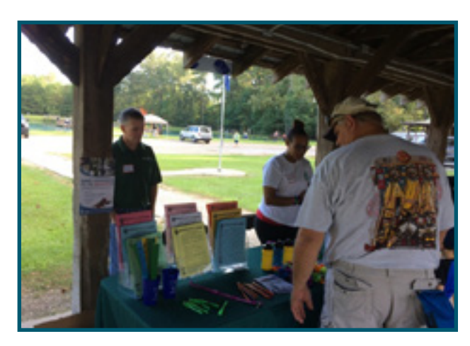
Figure 18. 2018 National Hunting and Fishing Day

Keep Louisiana Beautiful - advocates for a cleaner, greener, more beautiful Louisiana gathered to present and share best practices that encourage environmental stewardship. provided LDEQ information on NPS pollution.