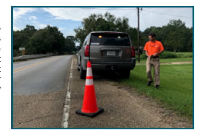
Figure 1. WS Environmental Scientist (ES) Supervisor, is wearing a safety orange t-shirt for high visibility and safety cones and vehicle flashing lights are used to alert traffic when conducting state business along roads and highways.

Safety is key to being in the field and is a main focus when selecting NPS sampling sites. Although safety management is considered with each location, a degree of caution is still exercised as a result of traffic uncertainty, road conditions and environmental elements.