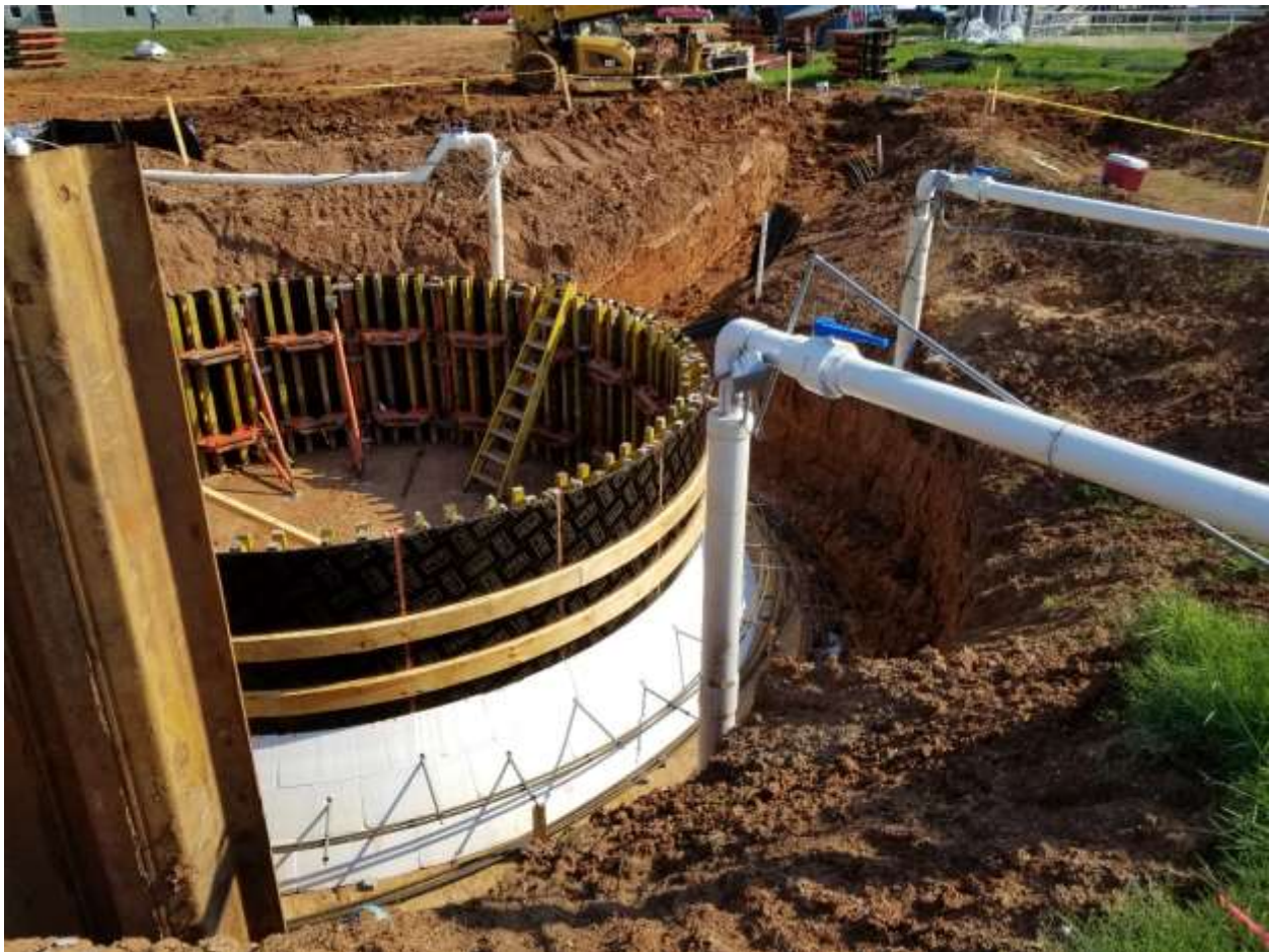
Picture 4: Contractor using a well point system when installing an influent wet well caisson at a WWTP