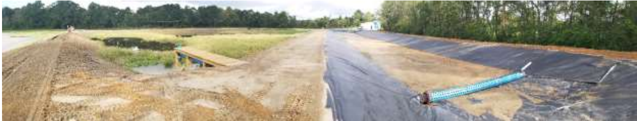
Picture 5: WWTP Upgrades – Installation of a Rock Reed Filter System

A copy of the IUP will be made available for public review and comment beginning June 20, 2019. Written comments will be accepted through close of business, August 1, 2019. (See copy of public notice Attachment 2.) Any comments received will be duly considered and will be provided to EPA.