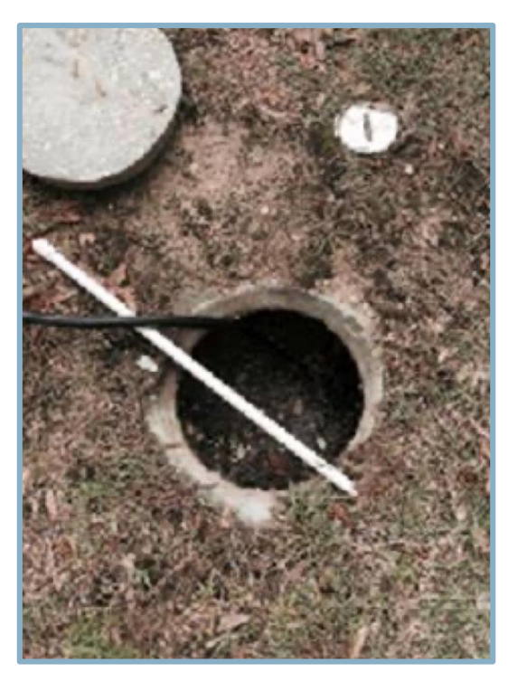
Fig 3. Home waste tank needing to be pumped out due to aerator not working for several years