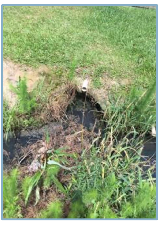
Fig 1. Ditch in front of home polluted due to home waste system not working

Capital RC&D continues its efforts of water quality improvements through partnerships with the parishes of East Baton Rouge, West Feliciana, East Feliciana, Tangipahoa, and the Louisiana Department of Health (LDH).