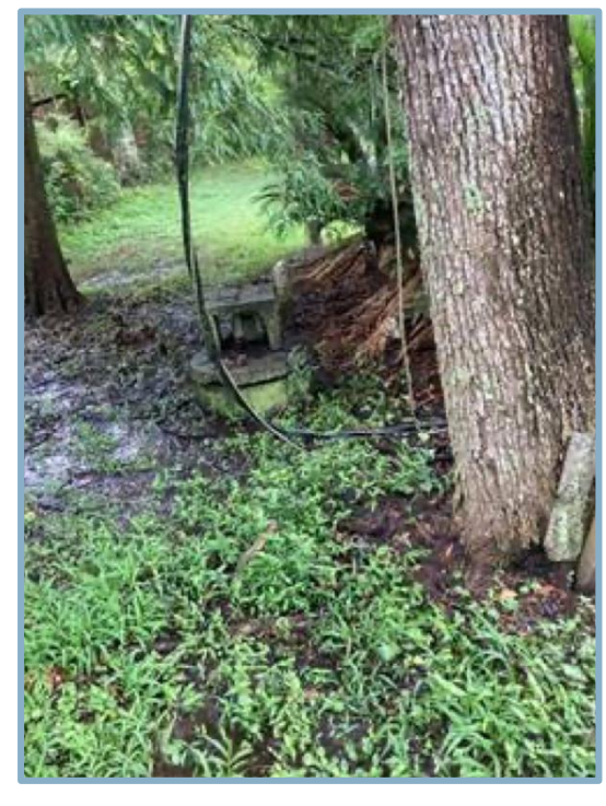
Fig 2. Sewage overflowing from an improperly managed home waste system