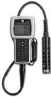
YSI electronic water meter

Electronic sampling devices are widely used to measure parameters such as dissolved oxygen, pH, salinity, conductivity, and temperature. There are several companies that make different versions but they all work in the same basic fashion. These devices work by lowering an electronic probe or group of probes into the water. The probes are attached to a small box-like device that allows the user to read the results for the various parameters. These devices must be carefully maintained and calibrated in order to ensure accurate measurements are obtained.