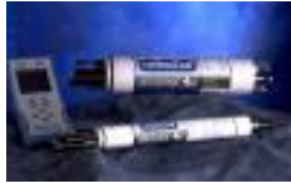
Hydrolab electronic water meter

Water sampling devices usually consist of bucket or tube-like devices used to obtain water from either the surface or deeper underwater. However, it is important to make sure the bucket or tube device is not made of or contaminated with chemicals that may result in false detections of chemicals in the water. Laboratory analysis has become so accurate, with detection levels in the very low parts per million, parts per billion, even parts per trillion and parts per quadrillion, that proper sampling techniques are more important than ever.