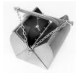
Van Veen bottom grab sampler

Flow or current meters are used to measure the speed of water flowing in a stream. This measurement along with measurements of the stream width and depth profile can be used to estimate not only the speed of the water but also the quantity of water moving past a given point on a stream. Flow measurements are usually given in cubic feet per second or CFS, and are known as a stream’s “discharge”. A sluggish bayou may have a discharge of 0.1 or even 0 CFS if there has been no rain in recent days. By contrast, the Mississippi River’s discharge ranges from about 200,000 CFS to 1,000,000 CFS. Discharge or CFS is important when estimating the quantity of various chemicals found in the water. This in turn is used by LDEQ to determine the amount of different pollutants that can be safely released into the water without harming aquatic life or humans. This determination is done using a mathematical model known as a Total Maximum Daily Load or TMDL. TMDLs are used to develop water discharge permits and to make recommendations regarding the prevention of nonpoint source water pollution. Taken together, these actions are designed to protect and improve the uses of water bodies in Louisiana.