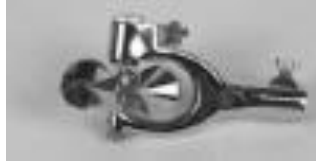
Pygmy flow meter