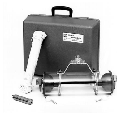
Van Dorn horizontal water grab sample bottle