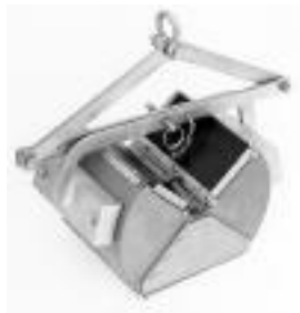
Ponar bottom grab sampler