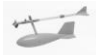
Columbus weight mounted flow meter