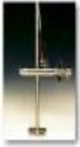
Wading rod flow meter