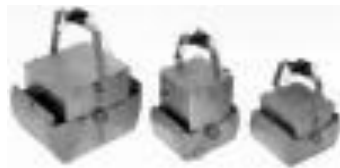
Ekman bottom grab samplers

Sediment sampling devices consist of various implements designed to grab sediment from the bottom of a water body. Some consist of long poles with a “clamshell” device on the end that closes and grabs the sediment. Others are weighted clamshells that are lowered into the water on ropes. Once the clamshell hits bottom, tugging on the rope causes the device to close and grab the sediment. Sediment samples are then sent to laboratories to determine if harmful chemicals are present in sufficient concentrations to cause harm to fish, macroinvertebrates, or humans.