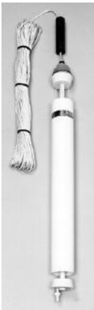
Kemmerer water grab sample bottle

Water sampling devices usually consist of bucket or tube-like devices used to obtain water from either the surface or deeper underwater. However, it is important to make sure the bucket or tube device is not made of or contaminated with chemicals that may result in false detections of chemicals in the water. Laboratory analysis has become so accurate, with detection levels in the very low parts per million, parts per billion, even parts per trillion and parts per quadrillion, that proper sampling techniques are more important than ever.