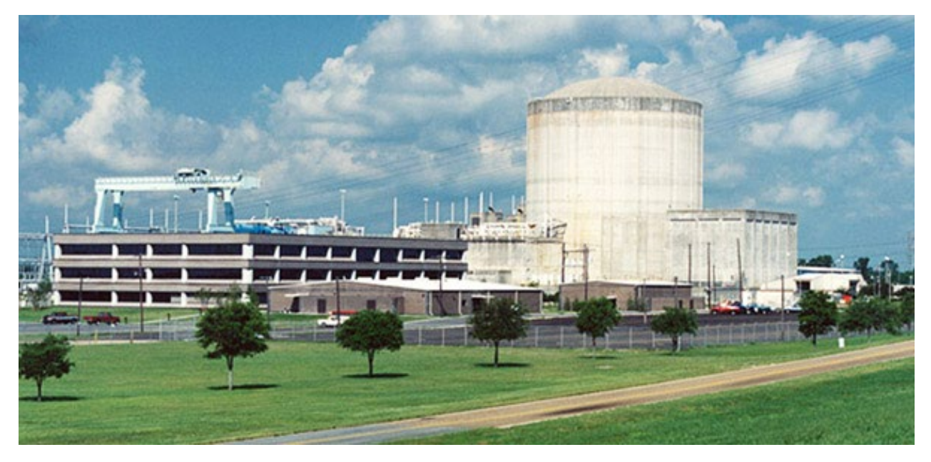
WATERFORD 3 NUCLEAR UNIT