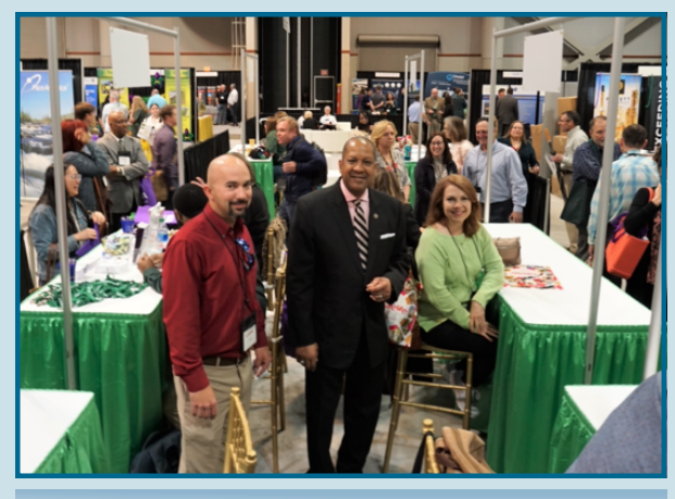
I enjoyed a stroll through the exhibits and stopped to visit at the LDEQ booth.

I want to extend a big "thank you" to all LDEQ personnel who gave presentations at the conference, manned booths and helped set up and clean up afterwards. Good job.