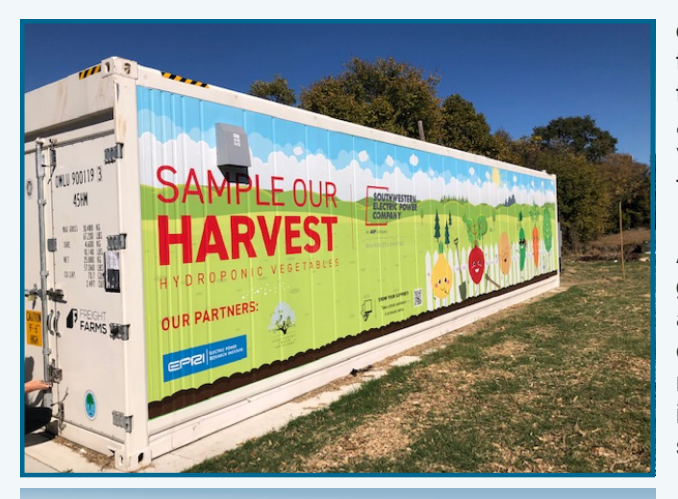
The Hydroponic unit is located along an area slated for development by Shreveport Green as a community farm