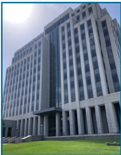
Capital Regional Office

The Acadiana and Southwest Regional Offices have conducted more than 3,650 landfill and emergency debris site assessments in response to Hurricanes Laura, Delta, and Zeta -- in addition to maintaining and meeting their normal inspection/work activity load. During FY-21, the office addressed more than 872 complaint calls, incidents and spills.