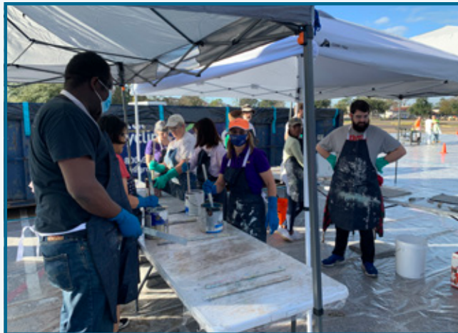
Volunteers rescued 75 five-gallon buckets of paint.

The collection day is a collaborative effort between the Baton Rouge City parish and other partners. For more information about recycling, paint disposal and common potentially hazardous materials in the home, go to www.brla.gov/890/Recycling-Office or the LDEQ recycling pages at www.deq.louisiana.gov/page/recycling .