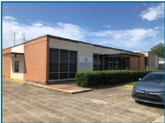
Bayou Lafourche Regional Office

As the smallest operating office within LDEQ, the staff of nine is frequently called upon to address an array of issues. As such, each employee is multi-faceted and capable of wearing many hats – trained and experienced in handling several environmental areas of concern.