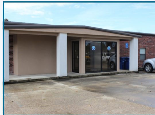
Acadiana Regional Office

Serving a majority of “Cajun Country,” the Acadiana Regional Office generally covers the region south of Alexandria and between Lake Charles and Baton Rouge.