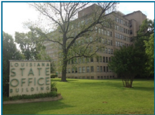
Northwest Regional Office

The office primarily handles calls regarding illegal water or waste discharges, illegal spills and open burning. Over the past fiscal year, the office has addressed more than 389 complaint calls, spills and environmentally-related incidents.