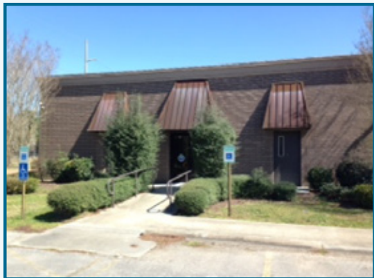
Southwest Regional Office

Southwest Regional Office – 1301 Gadwall St., Lake Charles, LA 70615 (337) 491-2667