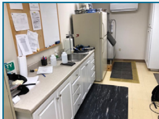
The space includes an equipment staging warehouse and a water sampling lab.