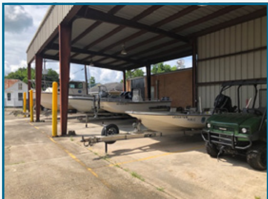
A series of covered parking bays allow the office to maintain boats in a secure location.

While wastewater treatment inspections and watershed surveys comprise the bulk of the office's day-to-day duties, the rural location and semi-autonomous nature of the Bayou Lafourche office means that everyone is called upon to address a variety of issues. On any day, an environmental scientist may respond to an open burning complaint, investigate an illegal dumpsite, conduct a water quality inspection, assist with an emergency response call or even help with air monitoring.