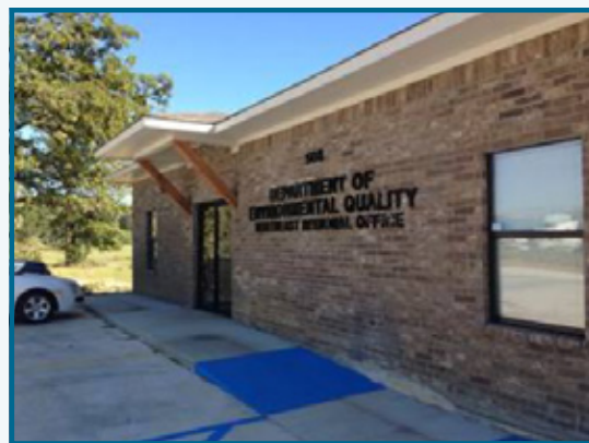
Northeast Regional Office

The Northeast Regional Office is located just off of Interstate 20 in West Monroe. The office has 20 employees, whose primary duties include air, waste and water inspections, along with radiological and underground storage tank inspections. An air monitoring station is also under the office's inspection rotation. The office maintains three boats for access to the Ouachita River and surrounding waterways.