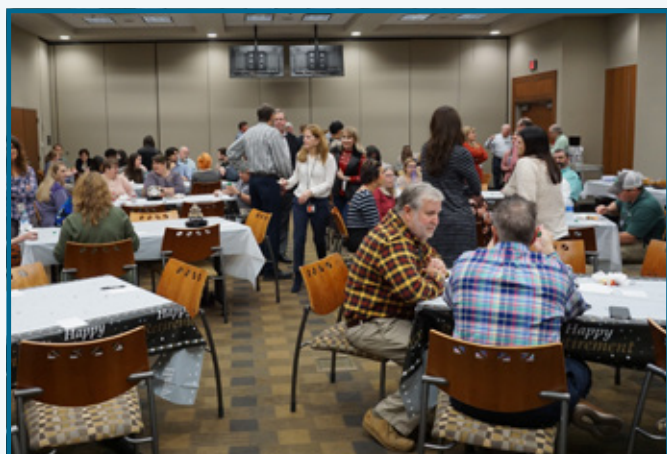
The event was a time for old and new friends to visit and enjoy some good food while saying goodbye to a beloved member of the executive staff.