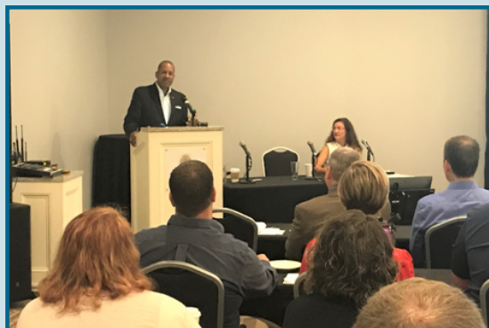
The room was packed for the LUST workshop.

This is my last message before the upcoming election, and I take this opportunity to remind all of you to go out and vote if you haven't already voted absentee. It's a right and a privilege to vote in America, the thing that makes our country what it is. Your vote counts, use it. Enjoy that feeling of participating in selecting your own government.