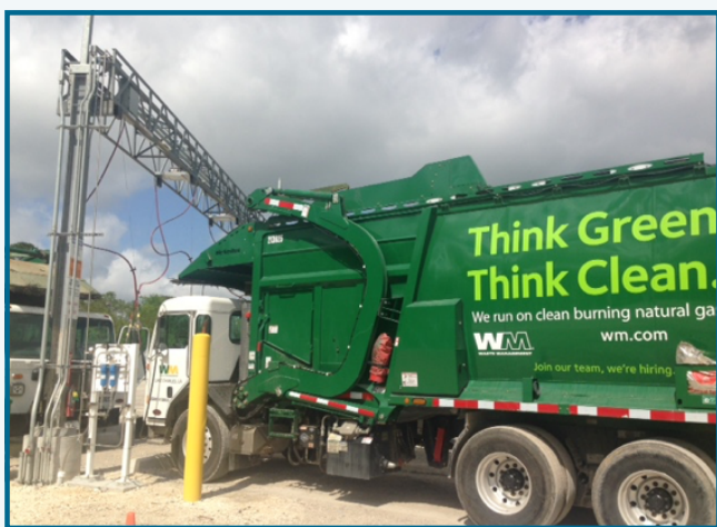
At Waste Management's Lake Charles facility, each truck can park at its own designated CNG fueling station, minimizing fueling wait times while maximizing efficiency.

With “Think Green, Think Clean” emblazoned on the side of their trash collection trucks, it was no surprise when Waste Management in Lake Charles recently announced their transition from diesel to Compressed Natural Gas (CNG) to fuel their entire vehicle fleet. In fact, the Lake Charles facility has already transitioned nearly half of its 50-vehicle fleet to CNG.