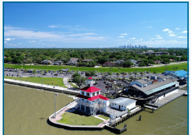
Proposed sensor deployment site on the south shore of Lake Pontchartrain

Learn more at the Village Blue Website: http://epa.gov/water-research/village-blue .