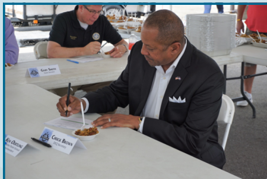
Picking a winning jambalaya was a more complex undertaking than I imagined.