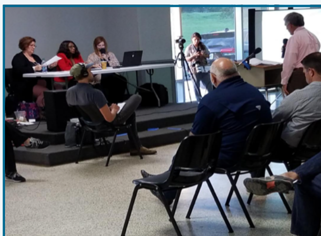
Public hearings offer an opportunity for anyone to submit comments for the public record to LDEQ on a proposed permit or permit modification being considered by the department.

For more information of the public hearing process, please visit: https://www.deq.louisiana.gov/page/the-public-participation-group .