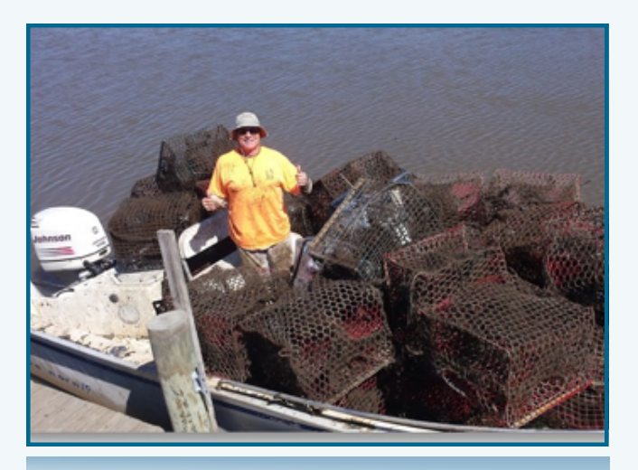
2019 Award Recipient - The Lake Pontchartrain Basin Foundation's Derelict Crab Trap Removal project removed 3,138 traps from the Pontchartrain Basin in 2019. At least 2,502 of those traps were recycled.