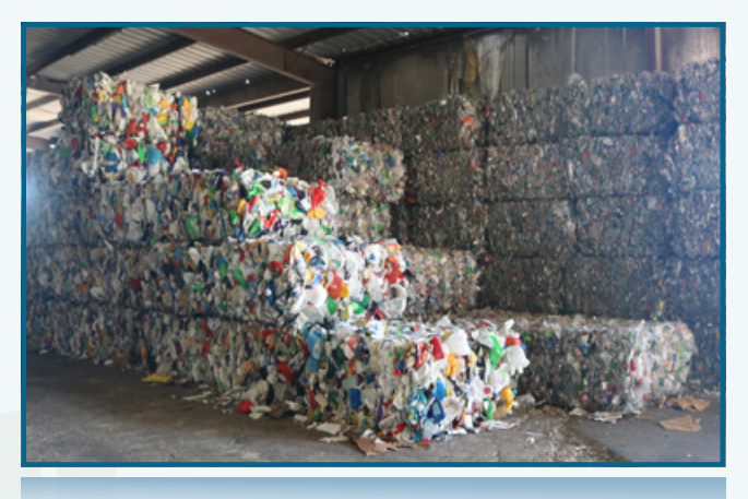
Recycled plastics baled and ready.