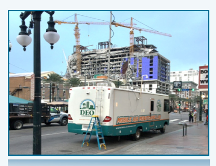
MAML monitoring in New Orleans