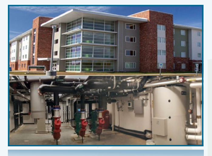
2019 Award Recipient - Southeastern Louisiana University's newest residence halls, Ascension Hall and Twelve Oaks Hall, draw from 220 geothermal wells situated 300 feet underground to heat and cool 556 rooms.

re you committed to improving the environment, your community and the quality of life in Louisiana? Do you have some voluntary environmental programs within your business, school or community that have been successful, innovative and have decreased emissions, pollution and damage to the environment? Then you might be one of the Louisiana Department of Environmental Quality's (LDEQ) next Environmental Leadership Program (ELP) award recipients.