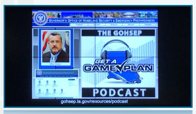
GOHSEP offers the public many resources to help prepare for a disaster or emergency including the 'Get A Game Plan' podcast available at gohsep.la.gov/RESOURCES/Podcast.