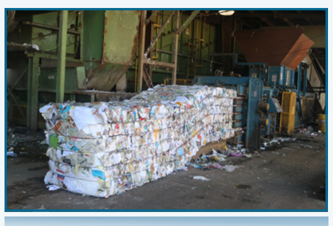
Mixed paper bale that weighs a ton to be reused.

For more information on recycling done right, go to recyclingsimplified.com .