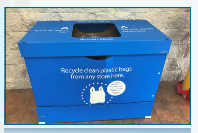
Many large retail stores offer bins to collect film plastic grocery bags which can be recycled – but not in home recycling bins.