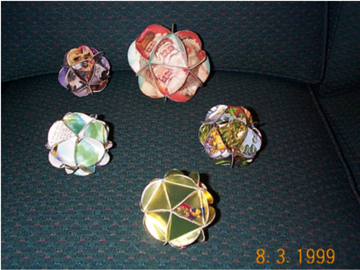
Enjoy and remember to reduce, reuse, recycle, and buy products with recycled content.