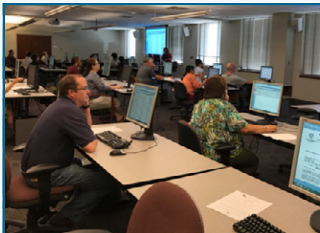
Enviroschool sessions are presented online through webinars or in classroom settings, depending on the course.

For answers to questions, please contact Tomeka Prioleau at (225) 219-0877, or email: Enviroschool@la.gov .