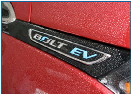
The Chevrolet Bolt EV is a fully electric vehicle powered by a rechargeable battery.