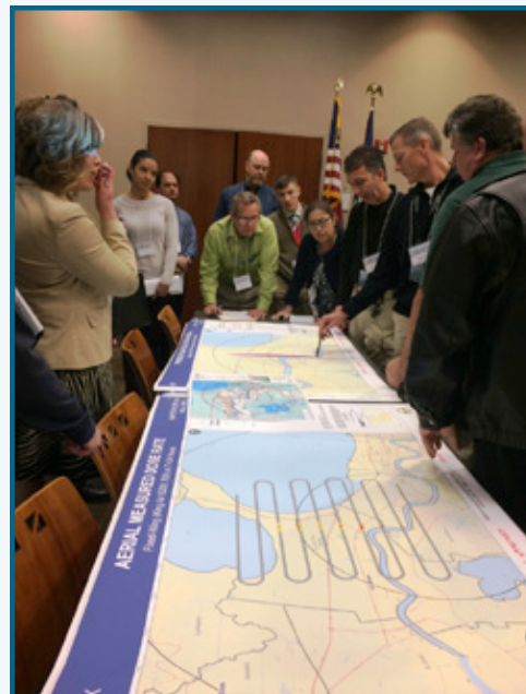
Tabletop drill participants examine maps to develop post-release strategy after a simulated release from Waterford III nuclear power plant.

As the scenario unfolded the first day of the three-day event, drill participants responded to the "plume phase" emergency where there is a release of radioactive gas/material that forms a plume. LDEQ field teams took readings (simulated) to determine the location and strength of the plume. That information was provided to local authorities in the form of a protective action recommendation (PAR). If the local officials accept the PAR, they can issue a protective action decision which can include actions such as evacuations and shelter-in-place orders.