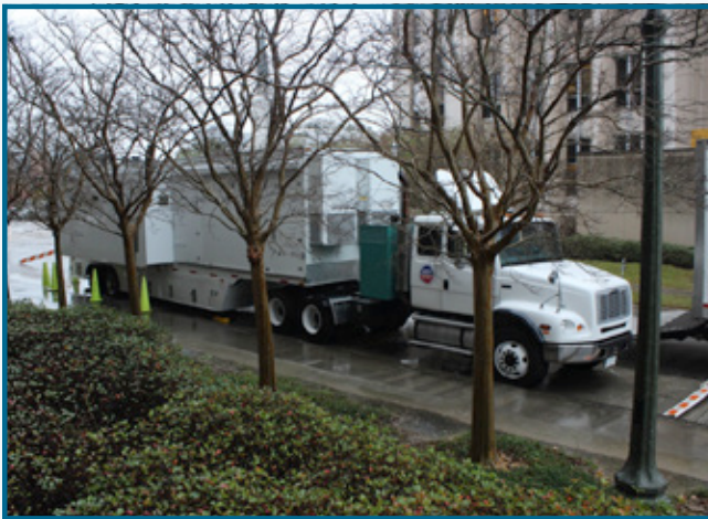
EPA Radiological Emergency Response Trailer parked outside LDEQ for use in the Ingestion Pathway Nuclear Drill.

On the final day of the event, the scenario shifted further into the future, six months or more, and decisions were reached about how to evaluate the effects of the release and what further actions should be taken to map out a path forward.