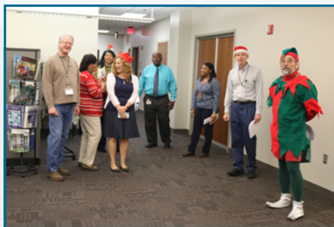
LDEQ employees sang Christmas carols throughout the building.