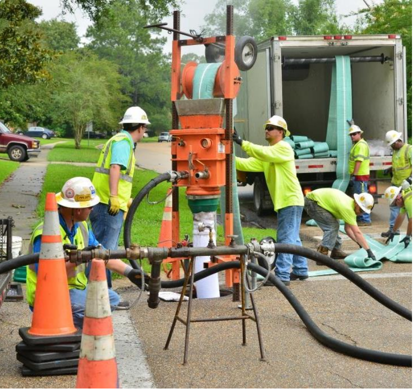
Connection to Sewerage: Regionalization