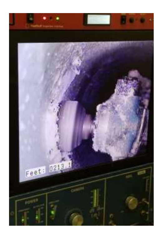
Picture 1: Contractor cutting out sewer gravity main CIPP lining to reconnect gravity service line.

LDEQ's FFY2018 capitalization grant mandates by Congress that not less than 10 percent of the FFY2018 grant (at least approx. $1,764,500) be put towards projects that qualify under the Green Project Reserve. In