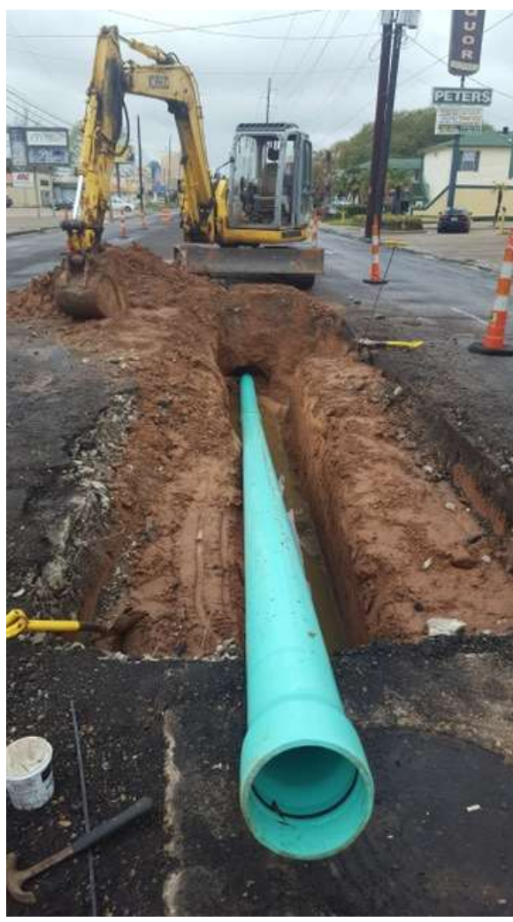
Picture 2: Collection system Rehabilitation – Pipe Removal and Replacement

LDEQ may bypass projects on the IUP List of Projects to be funded if they are later determined to not be ready to proceed. In those events, other projects from the Project Priority List may move to the funding list. The LDEQ CWSRF also reserves the right to provide funding for only a portion of the total costs of a project or only a portion of the amount requested where the municipality can, based on its ability to pay, obtain other affordable financing for the remainder of the project. A project may be bypassed if a different project should be funded due to an emergency condition that can only be addressed in an immediate time frame. Bypassed projects that retain their priority rating will be subject to the same eligibility and funding considerations from future allotments as other fundable projects. All projects must be on the Project Priority List in order to receive funding. All bypasses will be explained in the Annual Report.