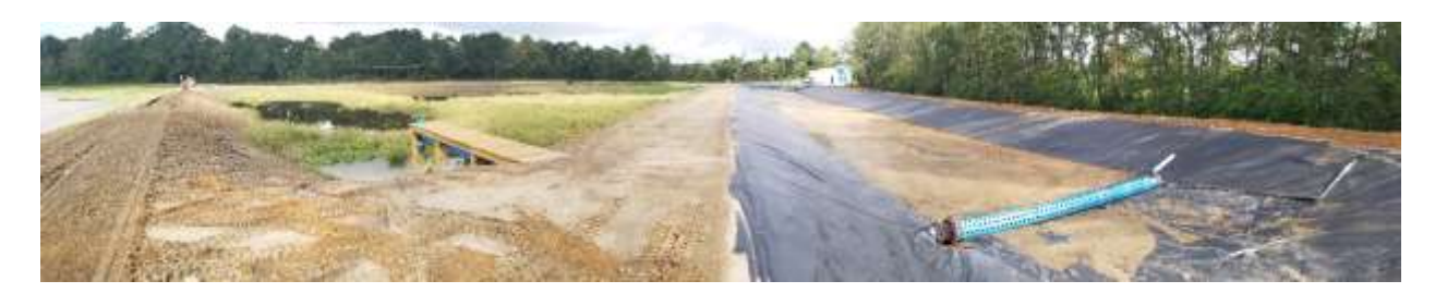
Picture 5: WWTP Upgrades – Installation of a Rock Reed Filter System

Following the revision in April 2020 to include FFY2020 subsidy projects, the IUP will be made available for public review as required. However, due to the COVID-19 pandemic, the public review and comment period will commence sometime subsequent to the work-from-home requirement.