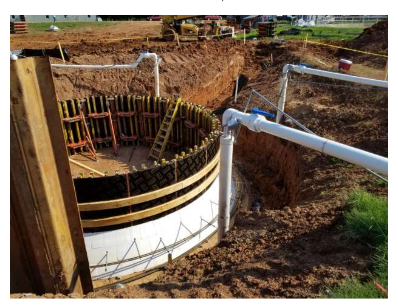
Picture 4: Contractor using a well point system when installing an influent wet well caisson at a WWTP