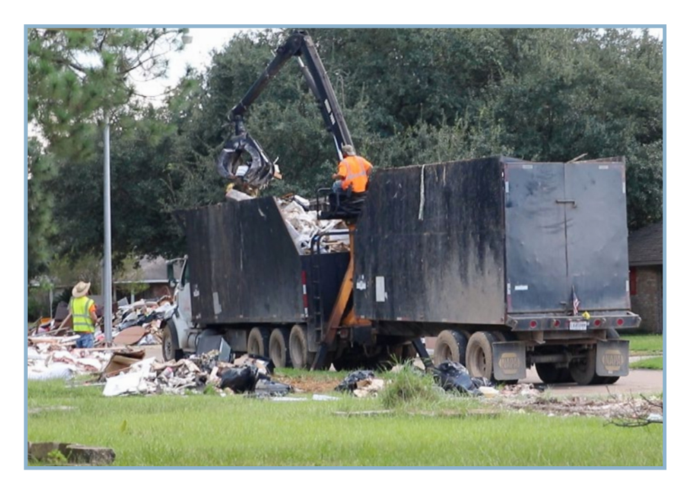
LDEQ oversaw debris management after the flood. The affected parishes contracted trucks to pick up the debris.

Temporary staging sites expedited the removal of debris and increased the amount of debris collected by 66 percent. The temporary staging sites were used only during the declared