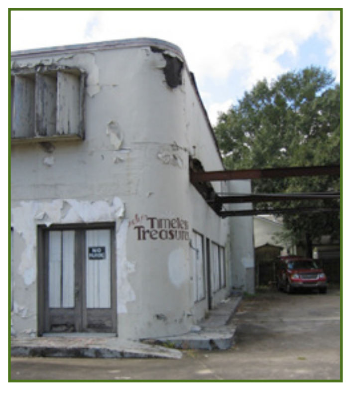
Timeless Treasure site before the remediation

The EPA Brownfields Program issued grants to assist with the assessment and remediation process for Timeless Treasures work, which took about four years and cost $300,000. A Certification of Completion was issued by the DEQ Voluntary Remediation Program once site work was completed in October 2012. The Ready for Reuse Determination letter Mayor Curry received is an acknowledgment by DEQ and EPA that environmental conditions on the property are protective of human health and the environment based on its current and anticipated future use.