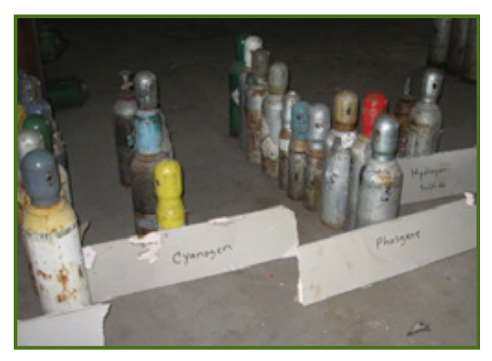
Additional abandoned cylinders containing hazardous materials were confiscated and identified.

Walker is alleged to have used his tank truck equipment to transport septic tank wastes and sewage and illegally dispose of the materials on vacant property he owns on La. 8, across from 4-H Camp Grant Walker.