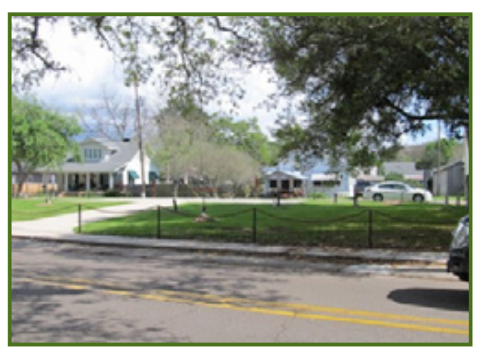
The Timeless Treasures site was changed from an eyesore to a green space in the middle of New Iberia.

Located within walking distance of New Iberia's historic downtown, the property at 121 Bridge St., formerly known as Timeless Treasures, is a rhomboid shaped lot approximately 0.18 acres in extent. Scenic Bayou Teche runs less than 100 feet away, and land use in the area is mostly residential. The property was transformed into a beautiful public green space that can now positively impact the lives of area residents as well as New Iberia's historic downtown.