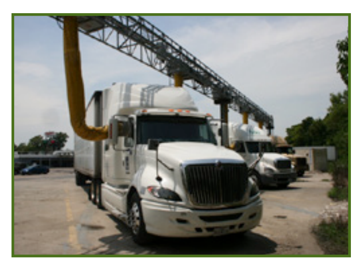
Trucks using IdleAir connections at Cash's Truck Stop at Interstate 10 exit 151 in Port Allen.

IdleAir, a Tennessee-based company owned by Convoy Solutions LLC, received a $200,000 Diesel Emissions Reductions Act (DERA) grant through DEQ to the Greater Baton Rouge Clean Cities Coalition (now Louisiana Clean Fuels) to fund a truck stop electrification project at Cash's Truck Stop in Port Allen. The project consists of 18 premium spaces (offering electrical, air/heat, USB and DirecTV capabilities) and 16 electric-only spaces that allow truck drivers to park, hook up to a unit, pay a fee and turn on air conditioning or heat – all without the need to keep their engines running. The electrification projects have already saved money on fuel, reduced noise and vibration