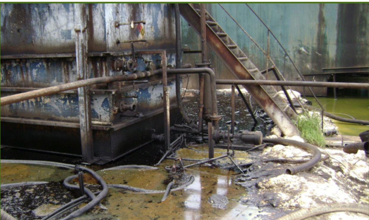
Untreated wastewater at the former Armant Environmental Services facility in Vacherie.