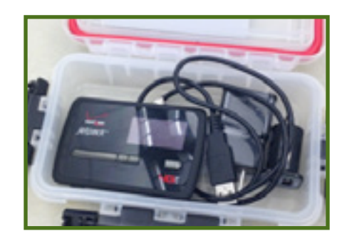
Portable wi-fi devices, such as this Verizon jetpack, can be signed out to DEQ personnel.

"We typically respond to between 1,100 and 1,200 phone calls and approximately 50 emails each month," said Lynam. "We provide contact information and can answer general questions, depending on the nature of the inquiry. Some inquiries from the public are of a technical nature, so the staff follows through to ensure callers get in touch with the appropriate contact."