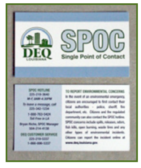
The SPOC card is handed out as a reference for information on reporting environmental concerns.

The Louisiana Department of Environmental Quality (DEQ) is authorized by the Environmental Quality Act to provide immediate response to any environmental problem or emergency incident which threatens human health or the environment. The Emergency Response Section, under the Office of Environmental Compliance, is tasked with meeting this obligation. This section began operation with the inception of DEQ in 1984.