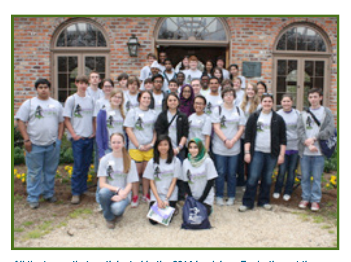
All the teams that participated in the 2014 Louisiana Envirothon at the Botanic Gardens of the LSU AgCenter.

The following are just a few of the many accomplishments and projects making a difference: